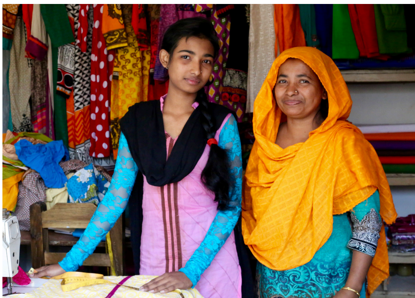
Teenage tailor, Bangladesh.

The finding of alcohol and drug use by children, in rural and urban sites, and by both girls and boys, was novel and worth exploring in future rounds. One NGO worker from Adabor said that both "consume Yaba [a mixture of caffeine and methamphetamine]", even though this is not acknowledged in the curriculum of the Kishori clubs.