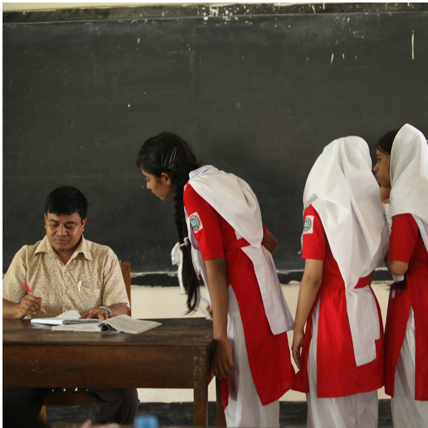
Students, Kamrun Nessa Government Girls School, Dhaka, Bangladesh.

at headquarters suggested that these 'victories' were not permanent as sometimes girls are moved and then married or parents just wait a few days.