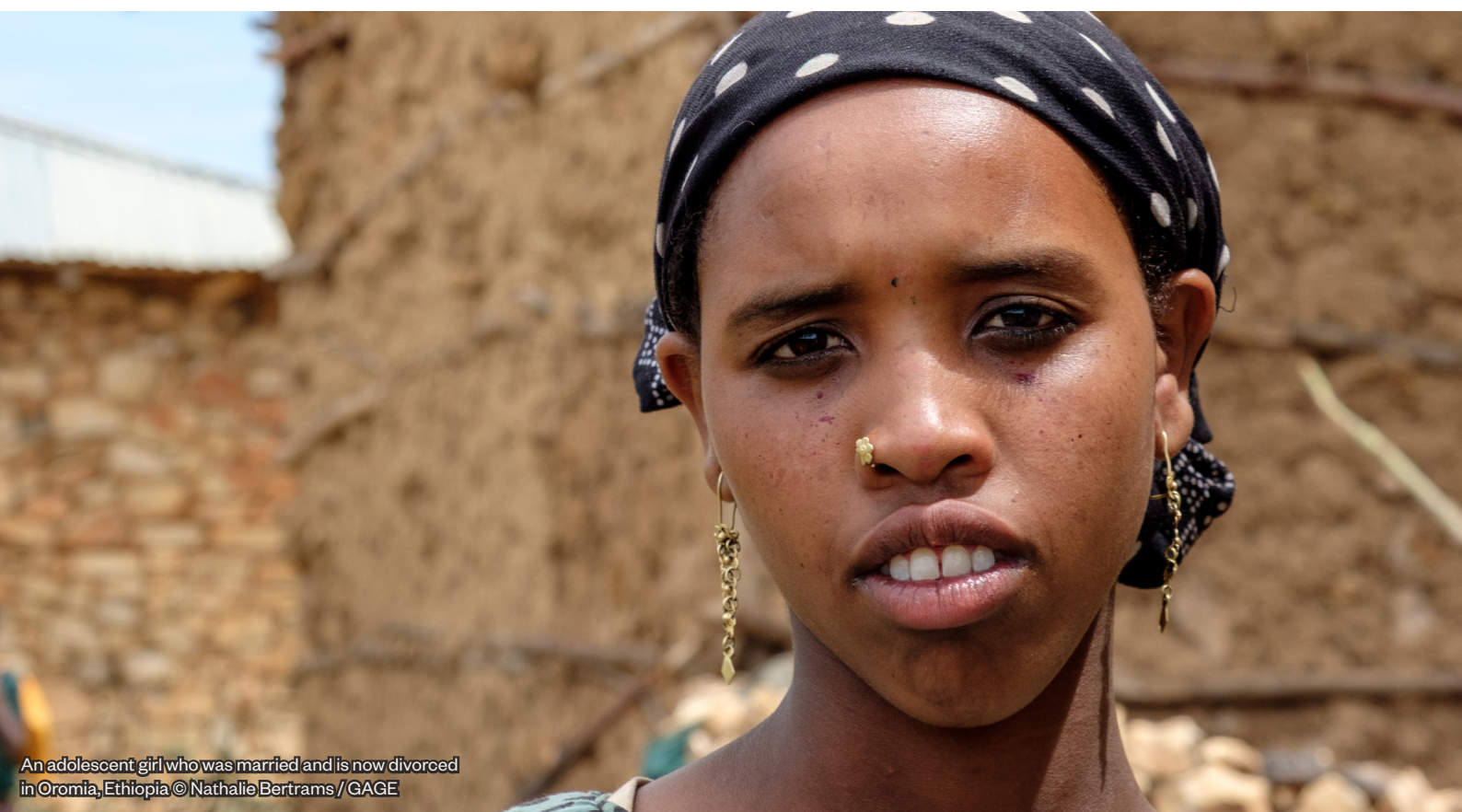
An adolescent girl who was married and is now divorced in Oromia, Ethiopia

Second, given the growing trend of adolescent-initiated rather than arranged marriages in East Hararghe (see Jones et al., 2016; 2019), our findings suggest that since the closure of schools, young people are spending more time participating in the nightly shegoye cultural dances. The shegoye is a local dance in which adolescents participate without adult supervision and is a key venue where young people meet future marriage partners. A 19-year-old boy from East Hararghe explained that this practice had increased during the pandemic: 'What do they do? Both boys and girls now all rush together to shegoye in the evenings. Many of them started love relationship among themselves. The school closure has created good opportunity for them.'