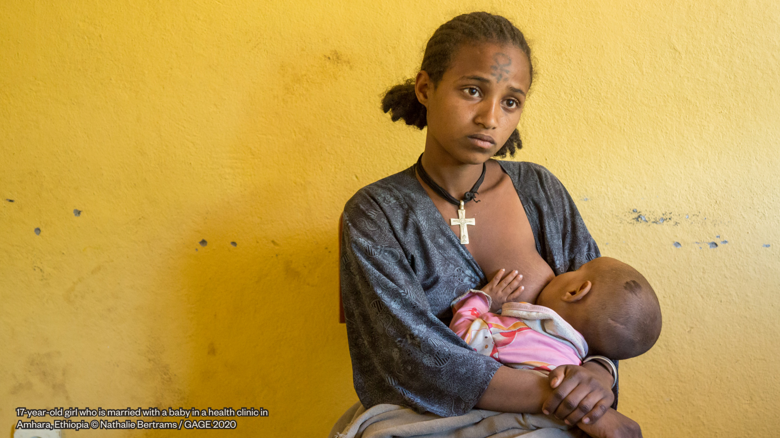
17-year-old girl who is married with a baby in a health clinic in Amhara, Ethiopia

ceremony of a child bride, the whole community had participated and had seen it as a cause for celebration. 'You have no idea what a wonderful wedding ceremony it was! No one was left from the locality as they were all attending the wedding ... The wedding ceremony was held two weeks ago between a 14-year-old girl and an 18-year-old boy due to school closure.'