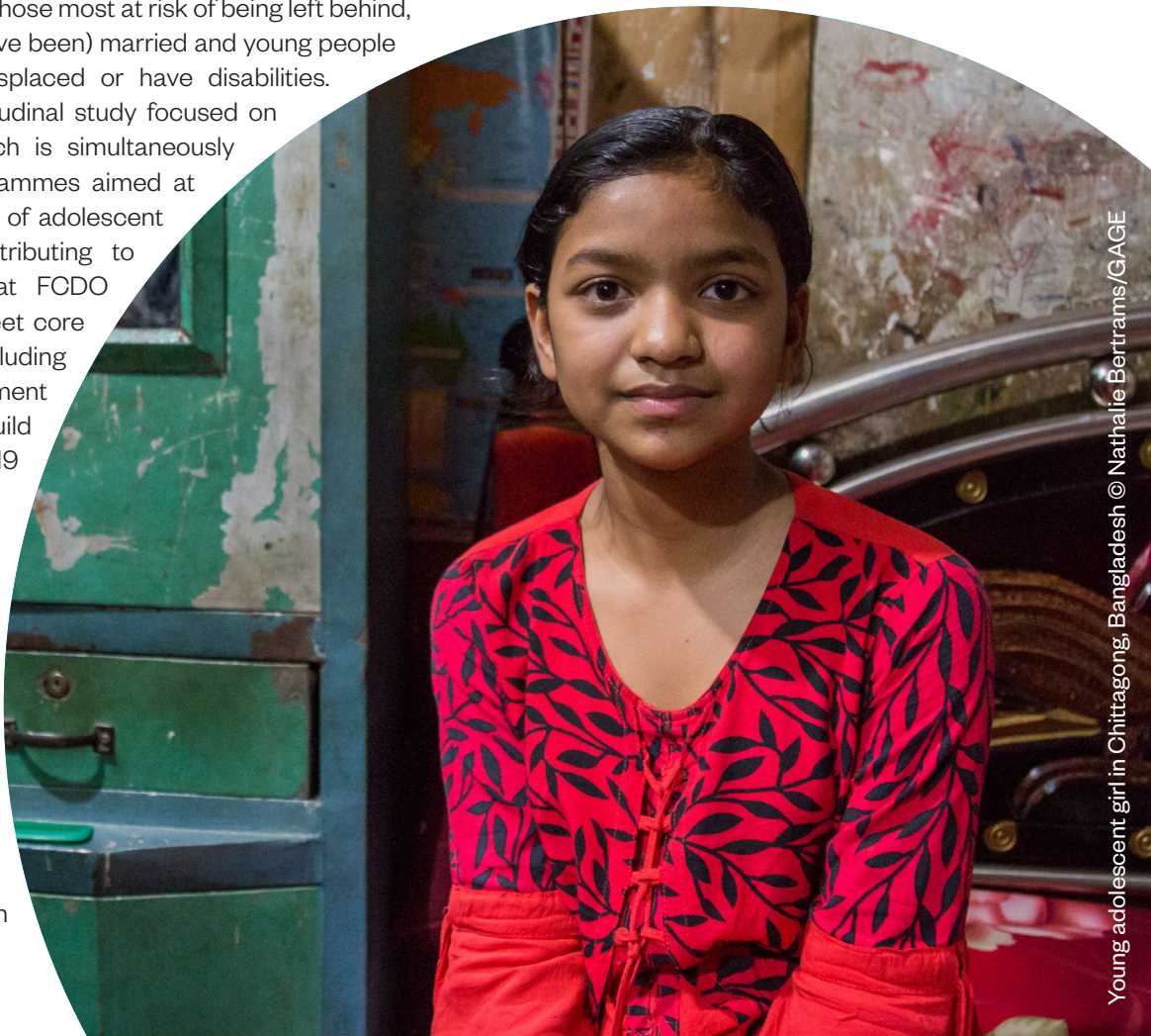
Young adolescent girl in Chittagong, Bangladesh

In Bangladesh, GAGE has collected mixed-methods baseline data from a school-based sample in Chittagong and Sylhet divisions, as well as virtual data collected at various intervals during the covid-19 pandemic. Quantitative baseline data was collected from 2,220 adolescents attending grades 7 and 8 in