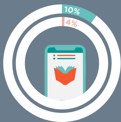
mobile learning apps

Girls were less likely to have access to :