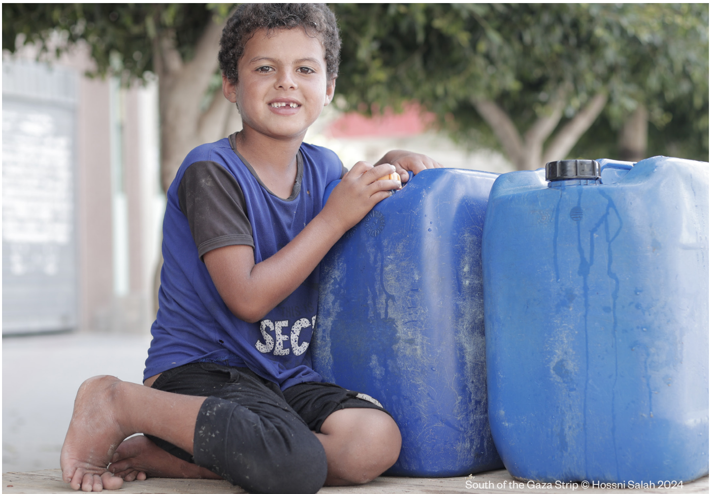
South of the Gaza Strip

This brief is based on the findings of a cross-sectional household survey conducted in August and September 2024 and in-depth qualitative research with adolescents and key informant service providers conducted in November and December 2024. The quantitative data involved 1,011 young people (526 girls and young women and 485 boys and young men, aged 10–24 years) who were proportionately sampled from across the five governorates of the Gaza Strip. The qualitative data sample involved 100 young people and 24 key informants. For both the qualitative and quantitative data collection, a two-day training course was held with 10 female enumerators for the survey and 6 female researchers for the qualitative data collection, covering data collection methods, safety precautions, ethical issues, and recruitment of participants. For the analysis, quantitative data was organised with the Statistical Package for Social Sciences software, while the interviews were transcribed and translated into English (from Arabic) and then coded thematically using MAXQDA, a qualitative software package (see also Abu Hamad et al., 2024; Vintges et al., forthcoming).